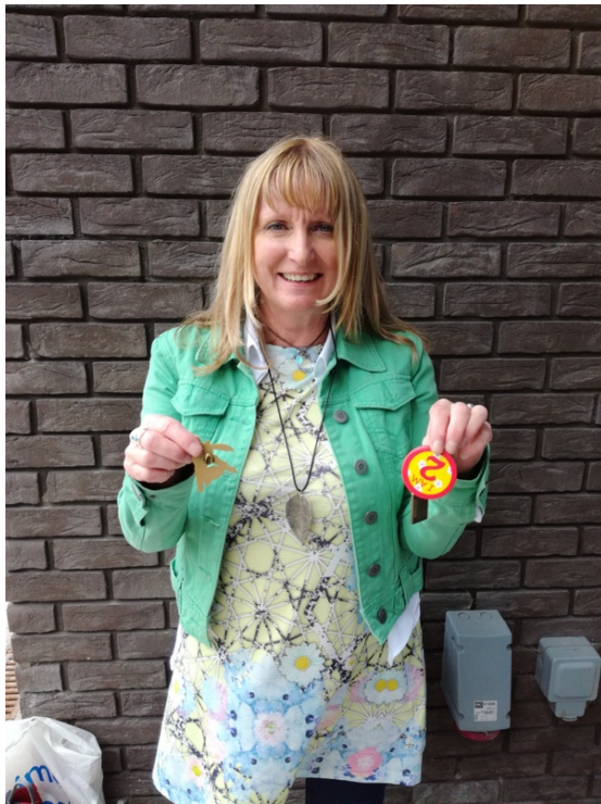
Portrait of C with various Avatars: Key Ring and Badge