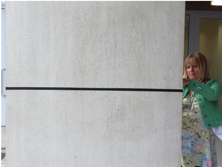
C setting up installation.