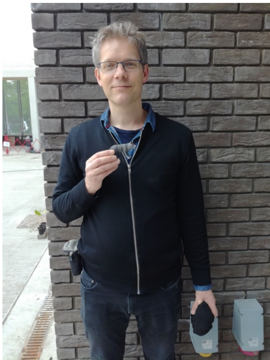
Portrait of T with Avatar: Wolf